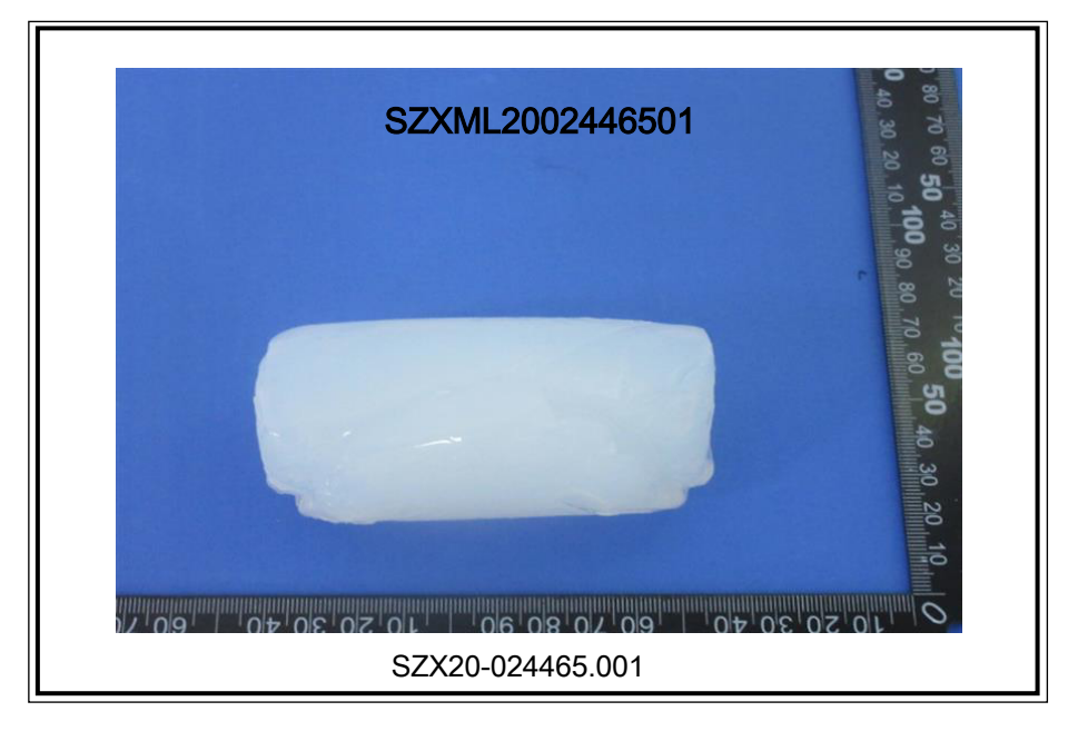
SGS authenticate the photo on original report only